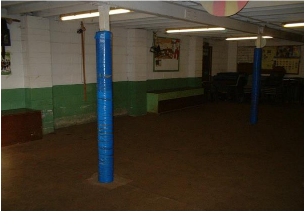
Lack of natural light