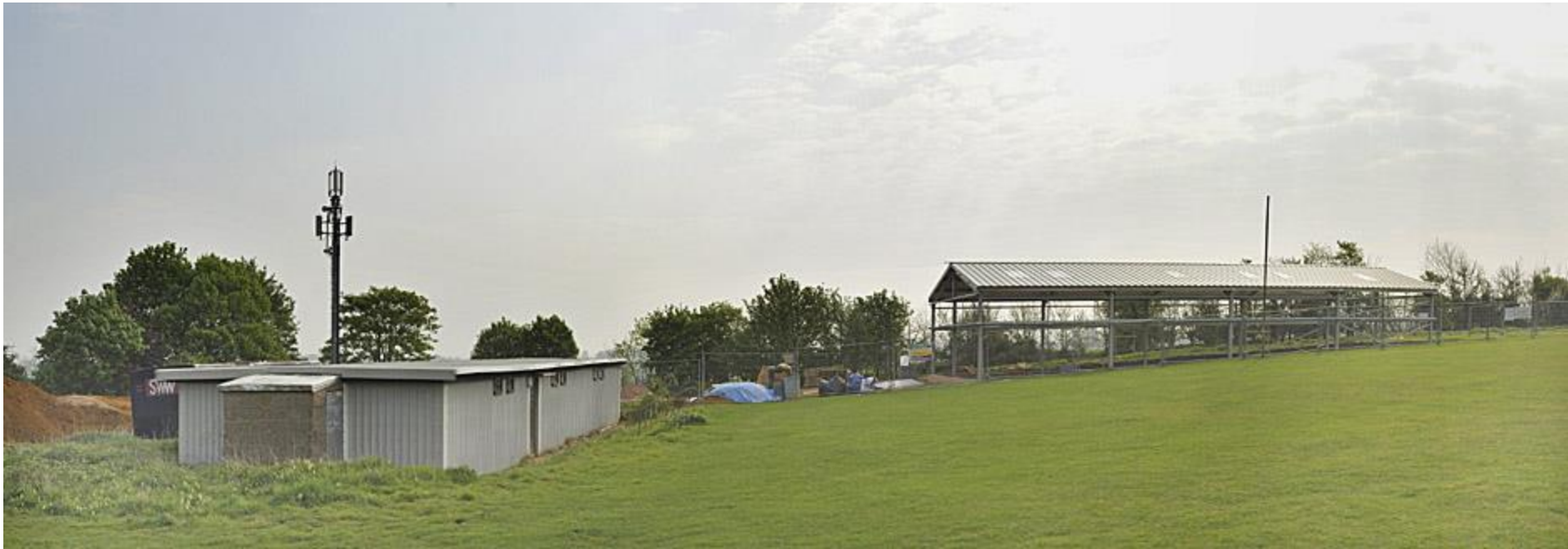
Left: Old Scout Hall